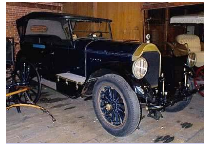
1924 Pierce Arrow