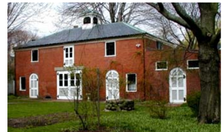
The Carriage House

Come see us when you get an opportunity. The summer time is a wonderful time to visit as the main house and the carriage house are open to the public from Memorial Day weekend through the end of October, Mondays through Saturdays. Make sure that you call us before you come as we do not want to miss your visit. As you know, you can reach us at 978-744-2111.